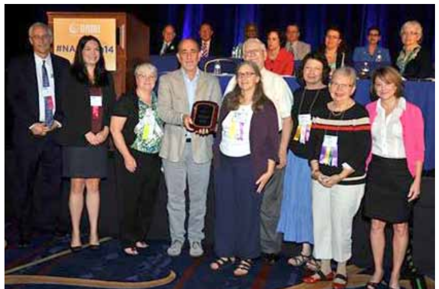
Staff and volunteers at the National Convention receiving our Outstanding Affiliate of the Year award.

Save the date for next year's conference in San Francisco: July 6-9, 2015